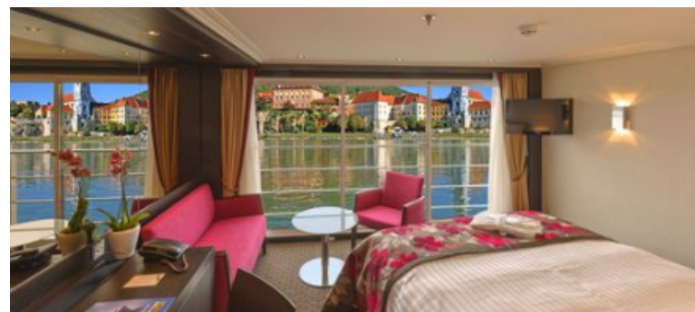
Panorama Stateroom, Cat A, B and P Artistry II SM