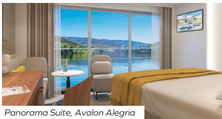
Panorama Suite, Avalon Alegria

Explore the dreamy Douro River and discover why its name translates to 'River of Gold' as you sail on its gleaming waters through Portugal's breathtaking panoramic beauty. Before sailing, begin your vacation your way with a three-night stay in beautiful Lisbon, the capital of Portugal. Experience the newest addition to our award-winning fleet of Suite Ships® - the Avalon Alegria SM . Like a blue ribbon threading through the green Douro Valley, the River Douro carries you through some of Portugal's most legendary landscapes.